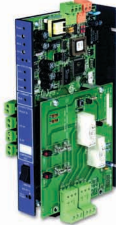
MT Compressor Refrigeration Nodes