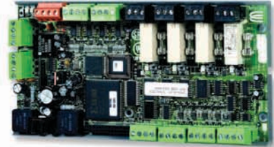
MT Suction Group